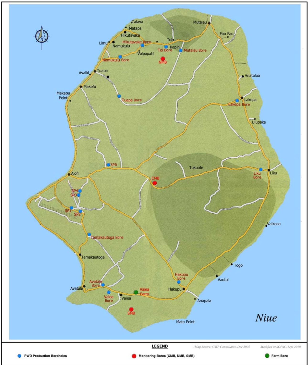
Map 1. Map of Niue showing the water sampling sites